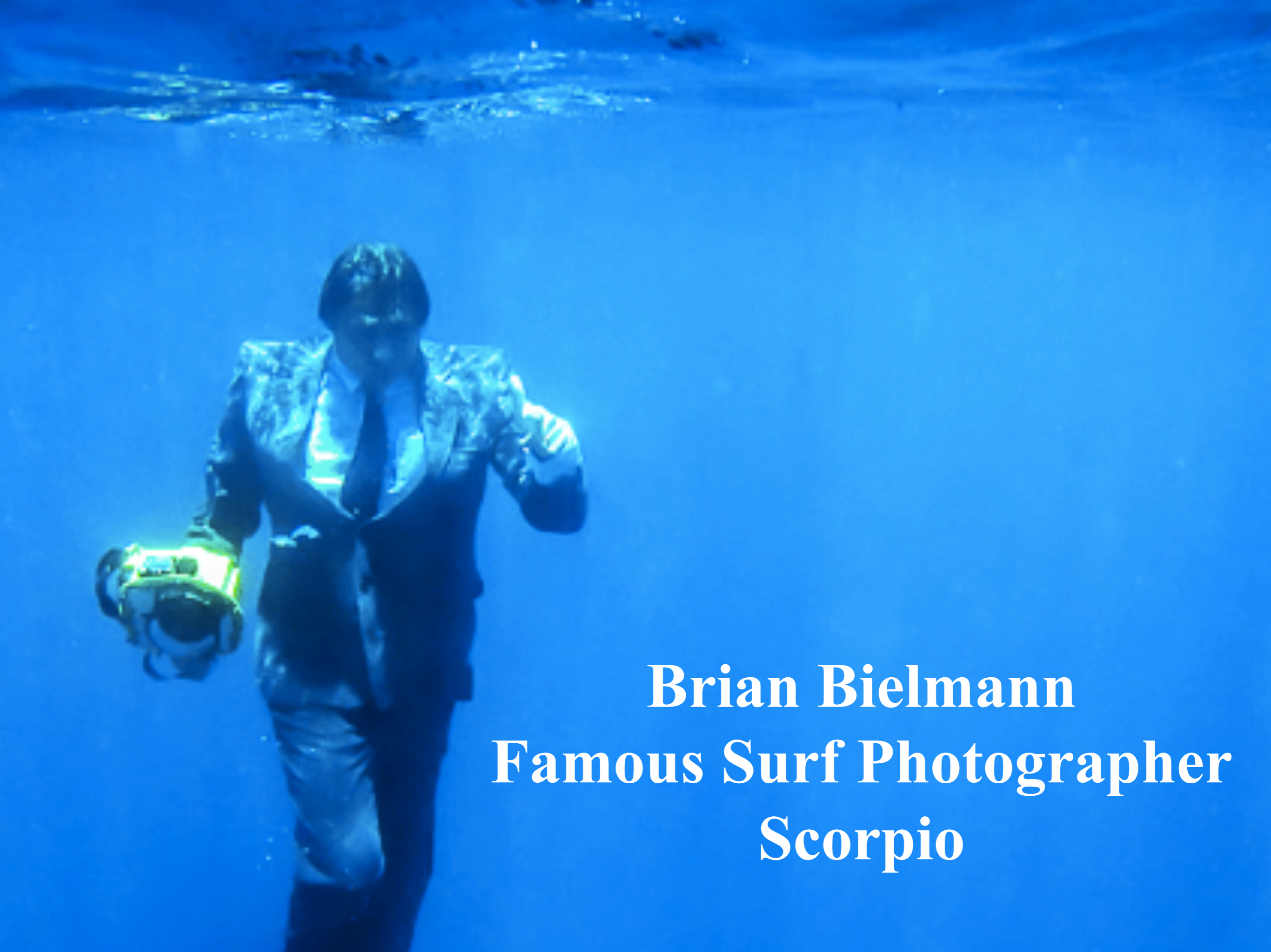
Brian Bielmann Famous Surf Photographer Scorpio